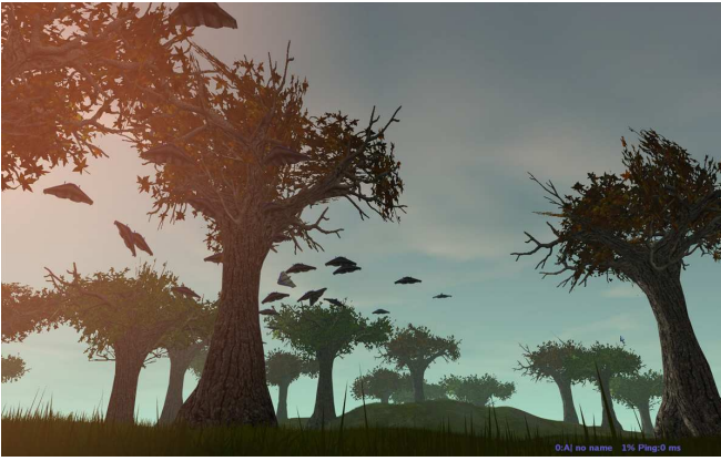
Fig. 2. Screenshot of the SPRING game environment. In the screenshot, airplane units are flying over the terrain.

rapidly adaptive game AI, the case base is used to extract an evaluation function and opponent models. Subsequently, the evaluation function and opponent models are incorporated in an adaptation mechanism that directly utilises the gathered cases.