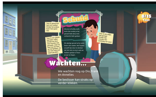
Figure 3: Screen captures of the poster mini-game. Left: the players are presented with textual and visual information on the emotion 'guilt'. Via the input-fields, they can share their personal experiences of this emotion with Ruby. Right: if the players choose to share their experiences in the game world, they become visible to the other players via 'post-it' notes next to the poster.

practice with sharing their experiences in a safe environment. When the players choose to share their experiences with the game world, it will make their answers visible to the other players. Their answers are made visible in the game world via notes that are pasted on the wall next to the poster. Sharing their answers with each other supports the third learning objective, as players can now see that they have different experiences with the same emotion.