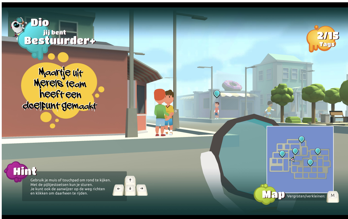
Figure 2: Gameplay capture of ‘Ruby’s Mission’: An Applied Game Intervention for reducing Loneliness of Children with Chronic Illness. A collectable graffiti tag is visible on the wall. In the distance stands an interactable character, which triggers a ‘scenario task’ (see Section 3.4.3).

The entire game consists of 8 levels. We have chosen for an intervention that lasts 8 weeks, the children will play one level per week. As far as we are aware, there is no standard for the length of these interventions. However, a recent systematic review of mentalization-based treatments found that relatively short interventions (under 12 sessions) were related to greater improvements in mentalizing, as compared to more intensive interventions [3]. Each level covers 3 unique emotions. A total of 24 emotions are discussed during the entire intervention. We designed three tasks to achieve the previously proposed intervention objectives. Each task is related to achieving multiple intervention objectives. These tasks are discussed in Section 3.4.2, Section 3, and Section 3.4.3.