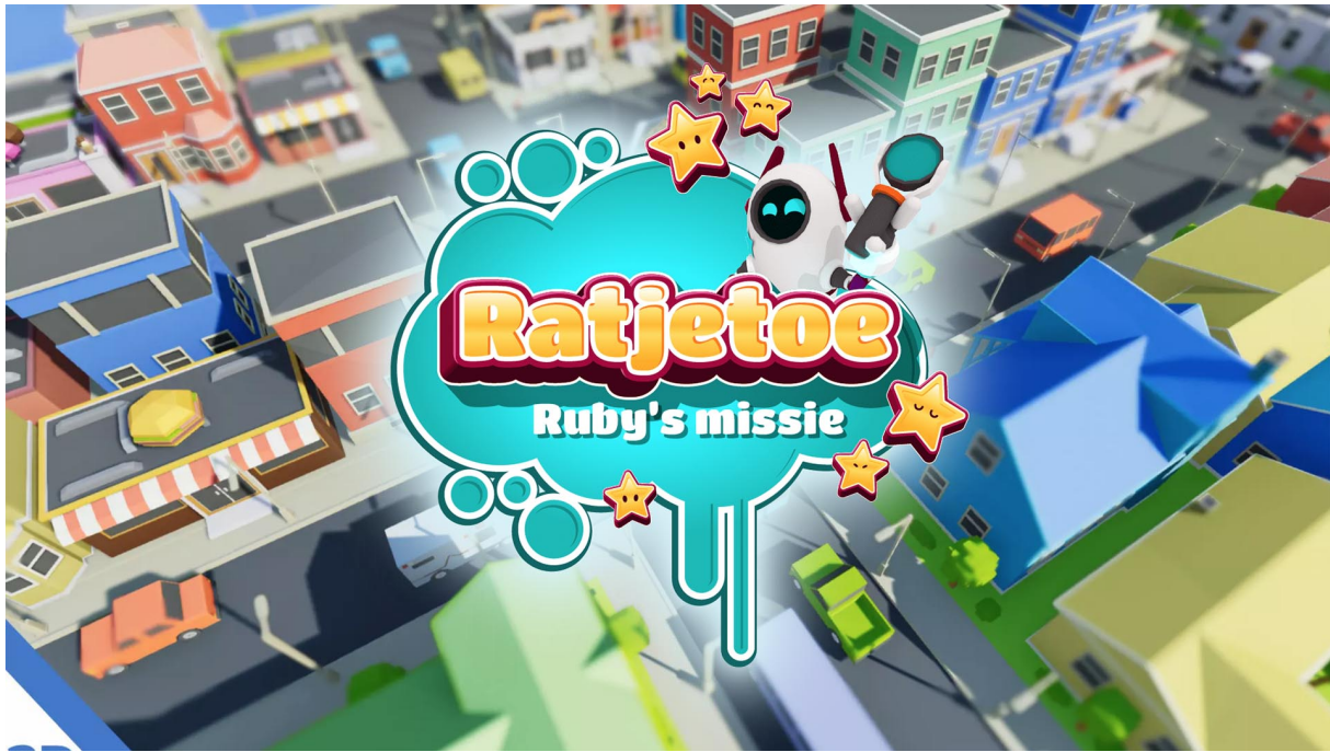
Figure 1: Splashscreen of ‘Ruby’s Mission’: An Applied Game Intervention for reducing Loneliness of Children with Chronic Illness

an implementation of such an interaction is to present the players with a set of events, from which the player must select the event that they associate most with a specific emotion. Asking players to couple given events to emotions, requires them to actively recall their past experiences and the emotions that they felt.