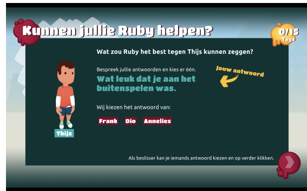
Figure 4: Screen captures of the poster mini-game. Left : The players select as a group which of the 7 emotions the character in the scenario is feeling. Right : A player is presented with one of the possible reactions to react with to the character. Below the players can select the answer of a single player (red buttons)